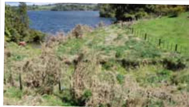
PHOTO 2: TAKEN IN 2009 SAME SITE AS ABOVE BUT WITH LITTLE SIGN OF SOIL LOSS. THE AREA HAS BEEN FENCED OFF FROM STOCK, PASTURE HAS RE-STABILISED THE SITE. GORSE HAS BEEN SPRAYED READY FOR NATIVE PLANTS TO BE PLANTED.

As you can see, there has been a vast improvement to the area. All that was required was a fence in the appropriate place. If you have any