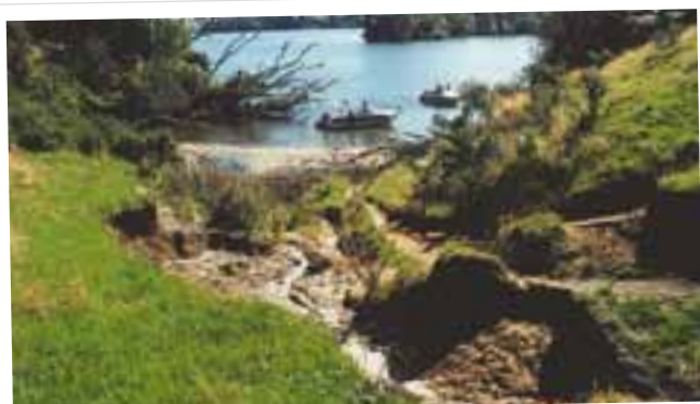
PHOTO 1. TAKEN IN 2001 NORTHERN LAKE ROTOITI. THE FOREGROUND SHOWS THE AMOUNT AND EXTENT OF SOIL LOSS THROUGH GULLY EROSION.

BEFORE AND AFTER PHOTOS OF SOIL EROSION (LIVESTOCK EXCLUSION). NORTHERN PART OF LAKE ROTOITI.